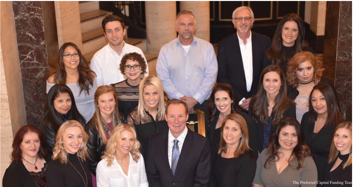
The Preferred Capital Funding Team