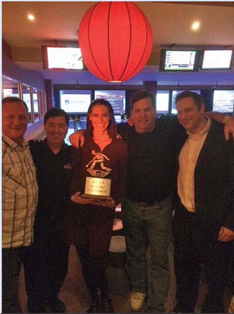
Bowling Tournament Winners